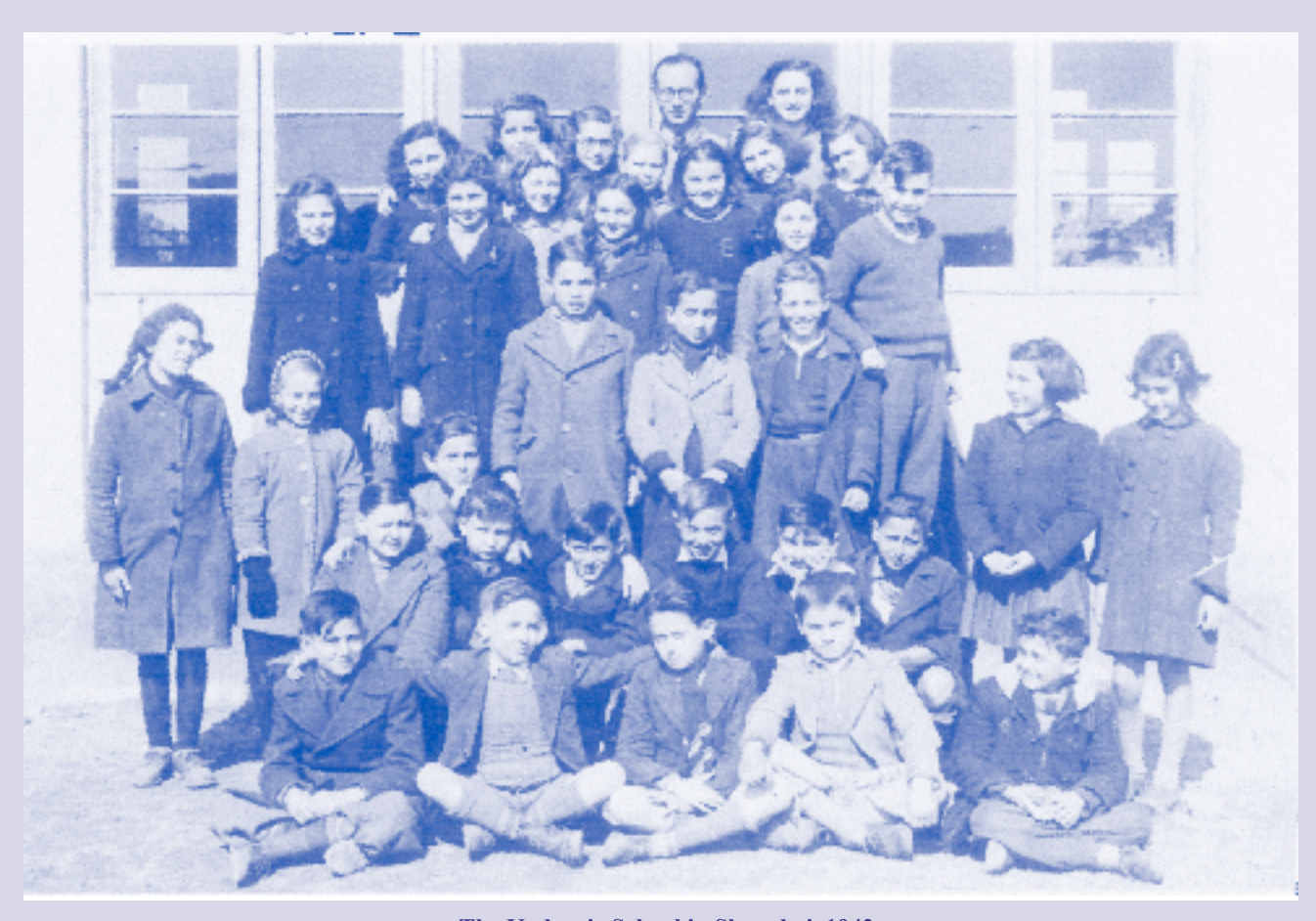
The Kadoorie School in Shanghai. 1942