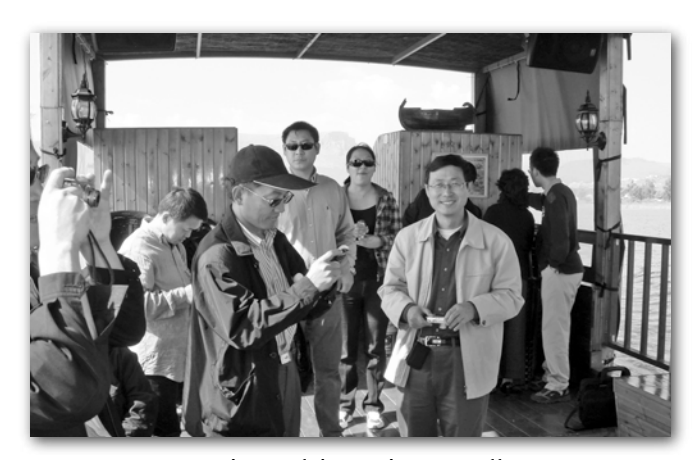
Members of the Embassy staff