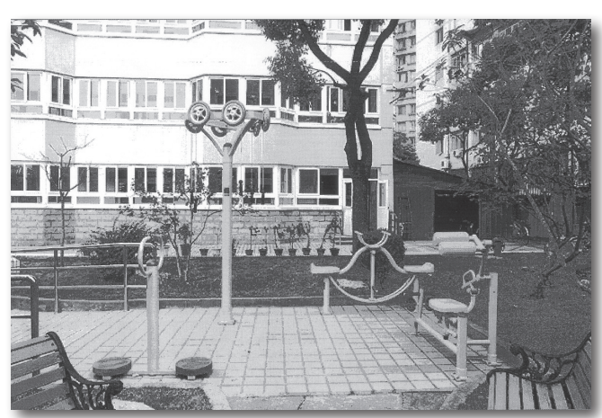
Sports equipment in the garden of the old people's home