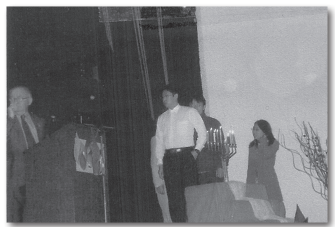
Students rise to the stage