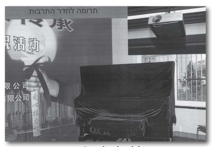
A piano for the club