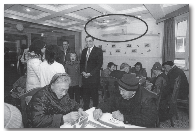
A heating system was installed on every floor of the pensioners' club. Uri Gutman, the Consul General of Israel in Shanghai, stands in the center