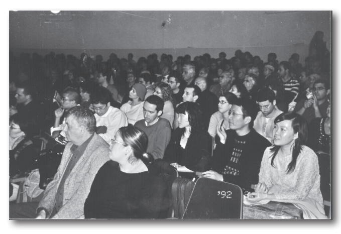
Israeli and Chinese students and guests in the hall of the Tel-Aviv Municipality Workers' Club