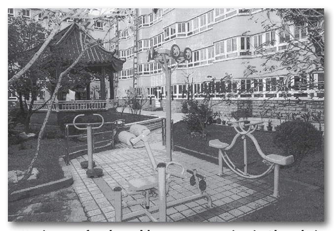
Equipment for the golden age generation in Shanghai