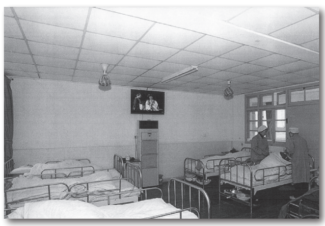
TV-sets in rooms for invalids