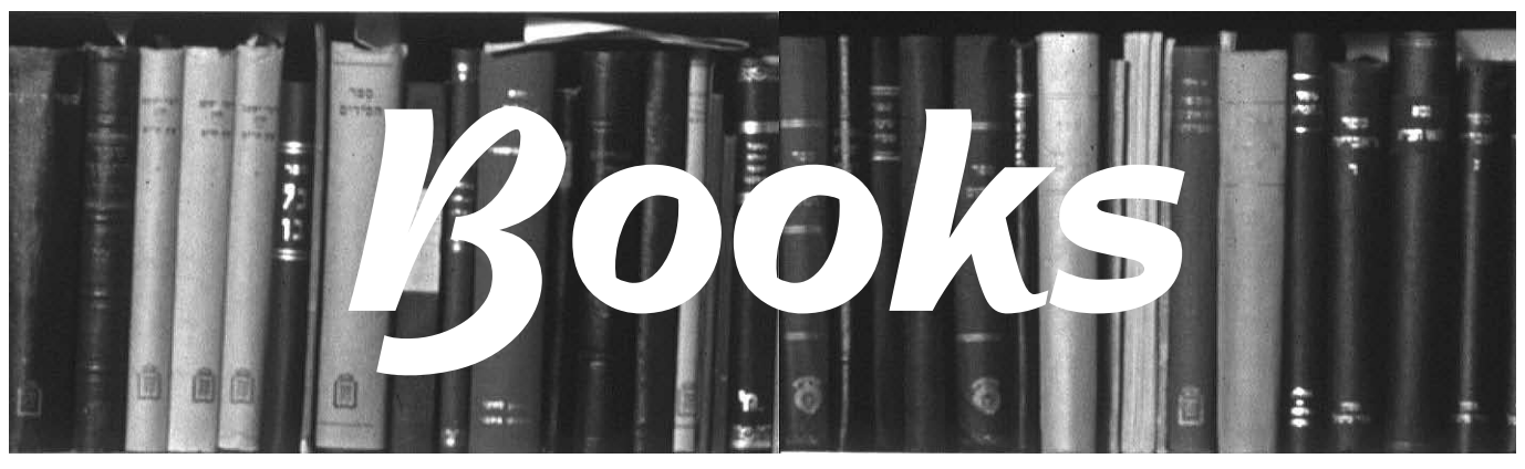
Book Review Republished from Journal of Indo-Judaic Studies: