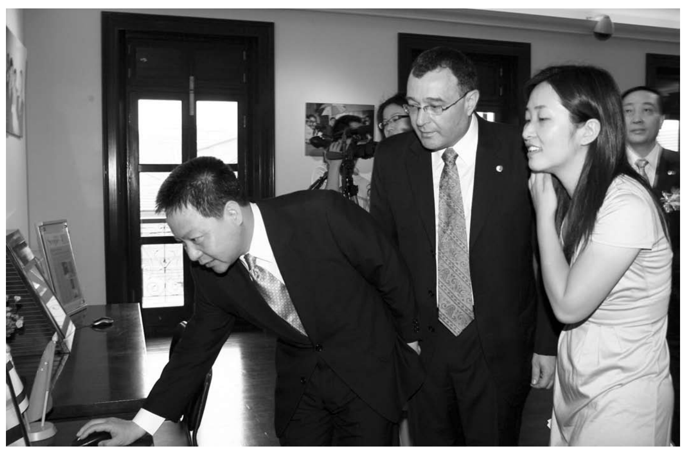
Demonstration of the Database to Vice Mayor Shen

needed equipment to the Hongkou Social Welfare House.