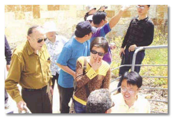
Visit to the aqueduct in Caesaria