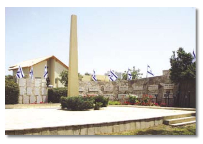
At the monument to heroes who fell in the wars of Israel