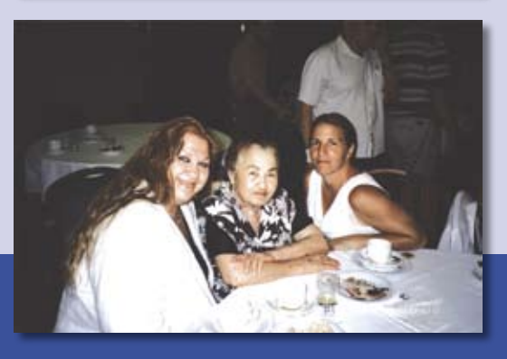
A get-together of former residents of China who live in Haifa and the Northern part of Israel took place in the "Nof" hotel on June 16, 2008.