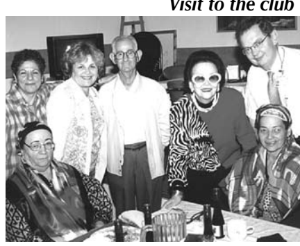
Visit to the club