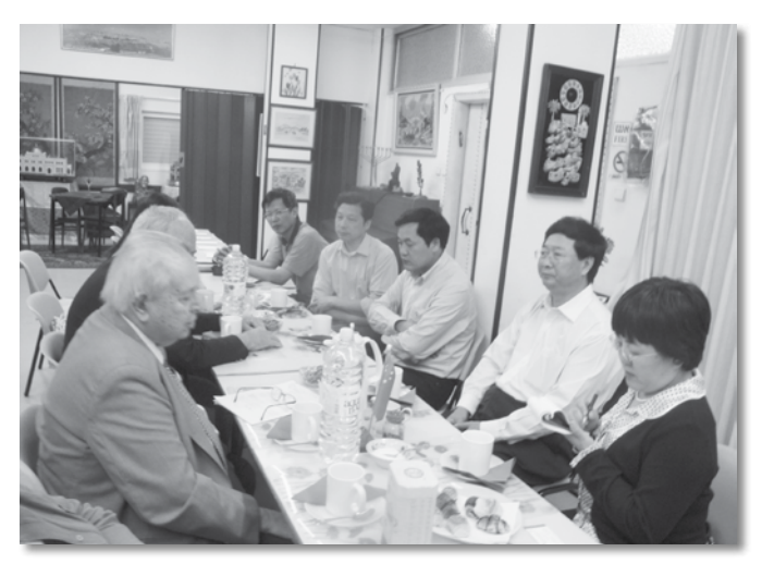
At the Synagogue of the Jewish Communities in China