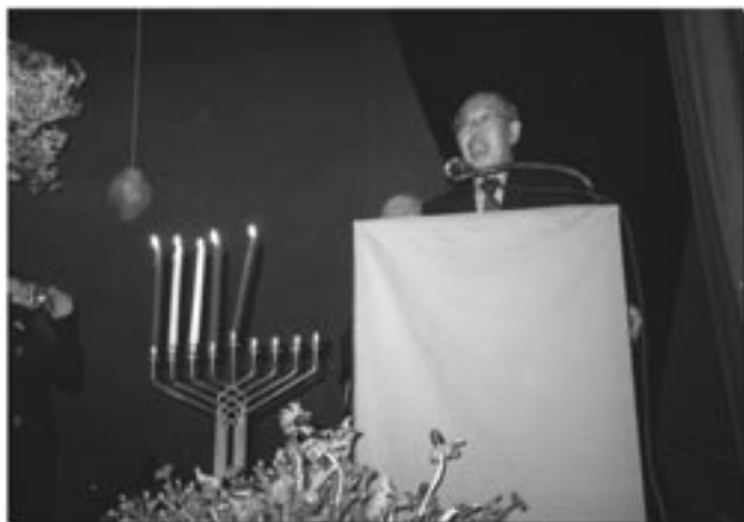
Ambassador Chen Younglong of China greets.