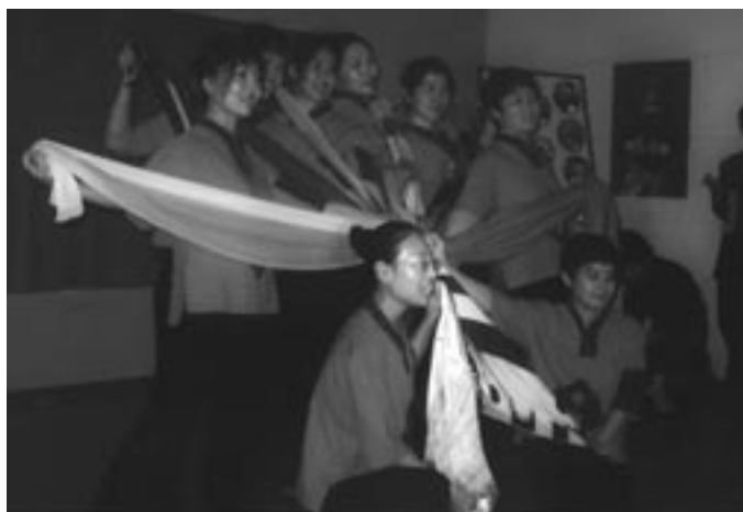
The ladies' dance ensemble of the Chinese Embassy performs a Chinese folklore dance