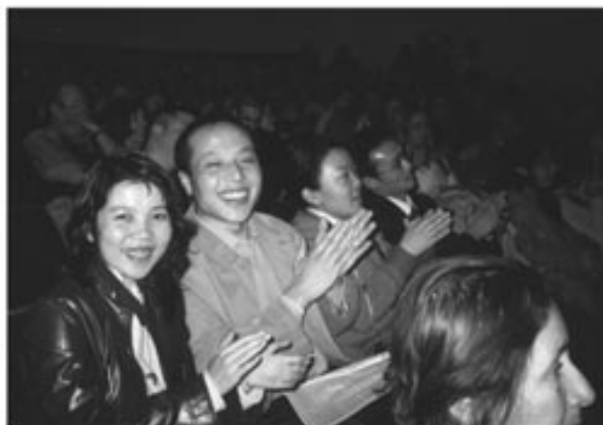
Chinese students applaud.